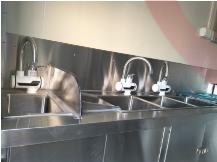
- Sinks -