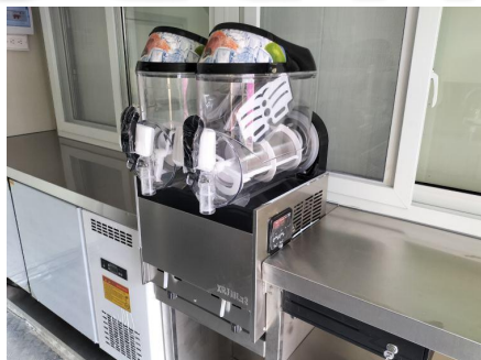
- Slush Machines -