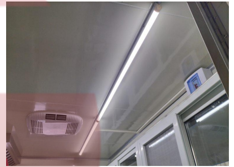
- Ceiling -