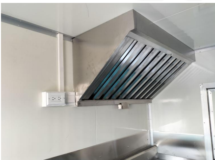
- Range Hood -