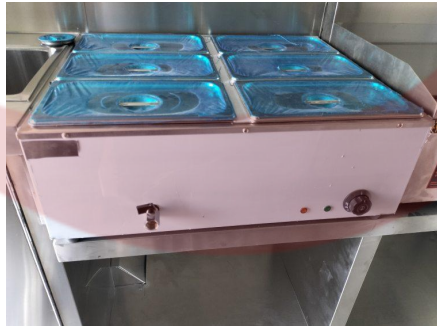
- Bain Marie -