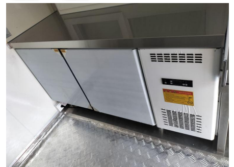
- Fridge -