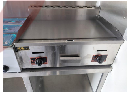
- Grill -